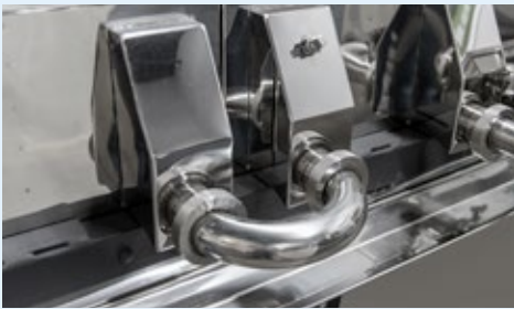
Stainless steel transfer fittings