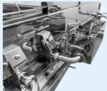
Transfer box with float