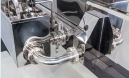
High-quality D&G knurled connectors