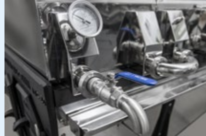
Syrup draw off ball valve and dial-thermostat