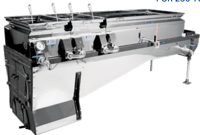
WOODFIRED 2' X 8' -FOR 250 TO 550 TAPS