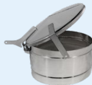
Stack pipe and stack cover