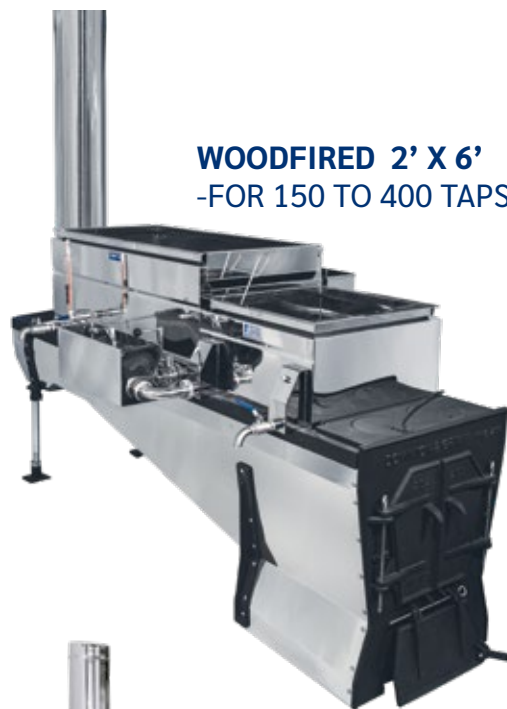
WOODFIRED 2' X 6' -FOR 150 TO 400 TAPS