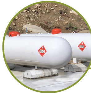
AVAILABLE FOR PROPANE