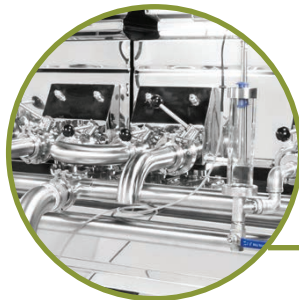
FLOW INVERTER WITH CENTRAL OUTLET