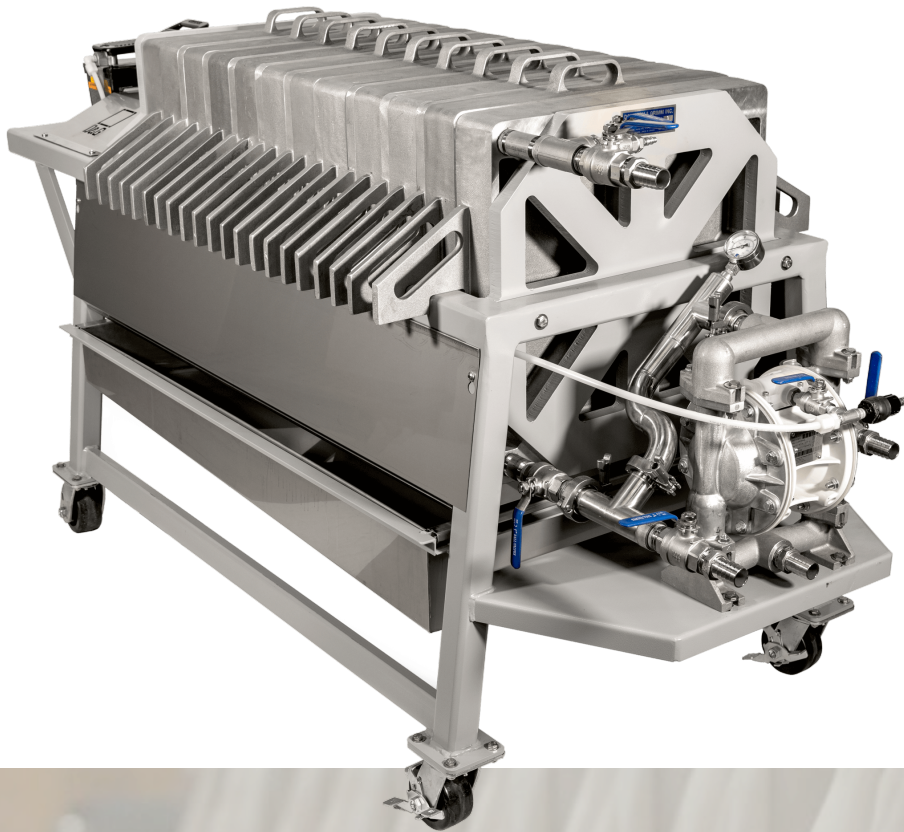
OPTION: INSULATED COVER