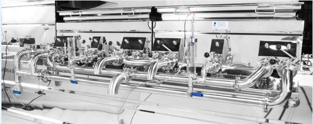
Flow inverter with central outlet