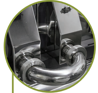
HIGH-QUALITY D&G KNURLED CONNECTORS