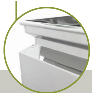
AESTHETIC PAN AND ULTRA-STRONG D&G FOLD