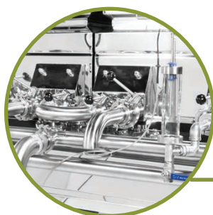
FLOW INVERTER WITH CENTRAL OUTLET